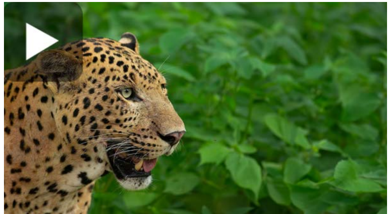
Leopard Dynasty—The Rise of Rana

The Sum of All Cities (Science/tech., 8x52 min.) A thrilling global tour exploring cities through their numbers—population, GDP, crime rate and more. Stunning visuals and in-depth research reveal the stories behind the numbers.